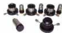
Phase and Dark Field

The LW Scientific I-4 microscope features exceptional optical quality with an infinity optical system, like found on the most expensive laboratory microscopes, but at a fraction of the price. The ergonomic narrow design allows users to rest their arms flat on the table and easily operate all controls. The binocular eyetubes can also be rotated upward to achieve an additional 2 inches of height for taller users. LED lighting produces "daylight" color, with a cool temperature and long life. Comfort, durability, dependability, and superior imaging make the I-4 a great value for labs, physicians, vets, and universities. The I-4 microscope is intended for use as a biological microscope in a professional environment in accordance with the guidelines set forth in this operations manual.