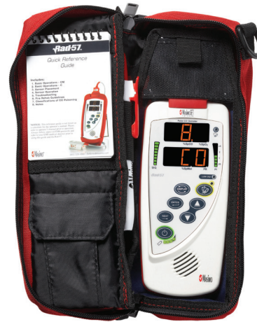
Rad-57 with EMS Carrying Case > PN 2208