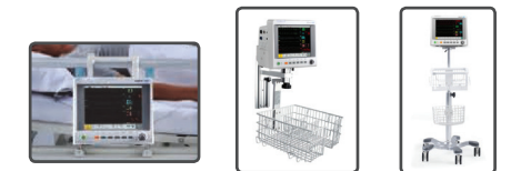
Bed Rail Hook