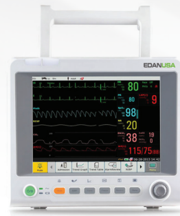
iM60 Patient Monitor