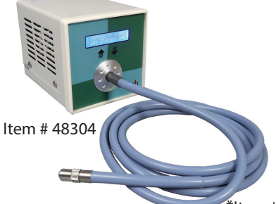
*Item # 48217