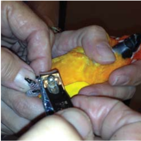
Bird nail trim