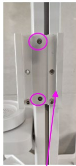
Guide rail of the AGSS bracket