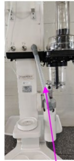
AGSS transfer hose

May need to order a ¼" purple vacuum hose with that nut & nipple connector