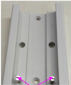
Bracket dowel pin