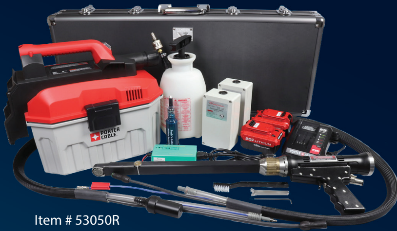
Item # 53050R