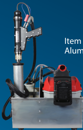
Item # 53051 Aluminum Carrying Tote