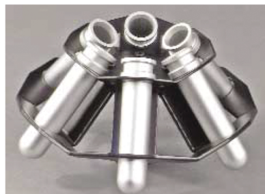
6 place Blood/Urine Tube Rotor (accepts maximum 12 ml urine tubes)