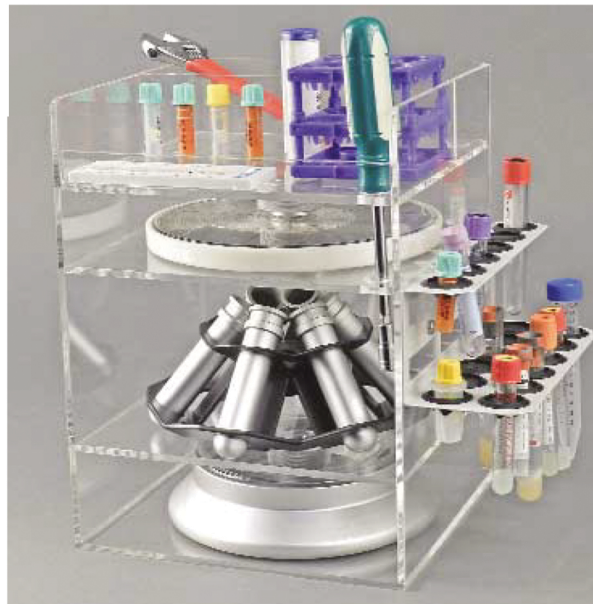
The BX Acrylic Rotor Rack organizes your rotors, rotor changing tool, and accessories all in one compact unit.