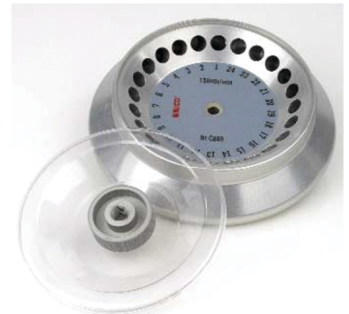
24 place rotor for 0.5 to 3ml Micro tubes

BX's feature maintenance-free brushless motors and a lid window for tachometer calibration checks. An intuitive button panel is quick and easy to use.