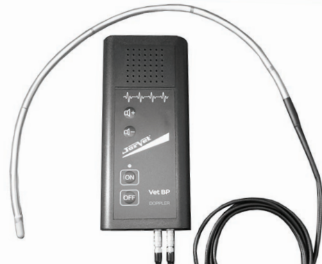
SKU | J0563ND11 Esophageal Probe