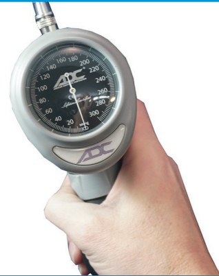
SKU | J0563ND3A Sphygmomanometer