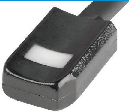
SKU | J0563ND1 8 mHz Flat Probe