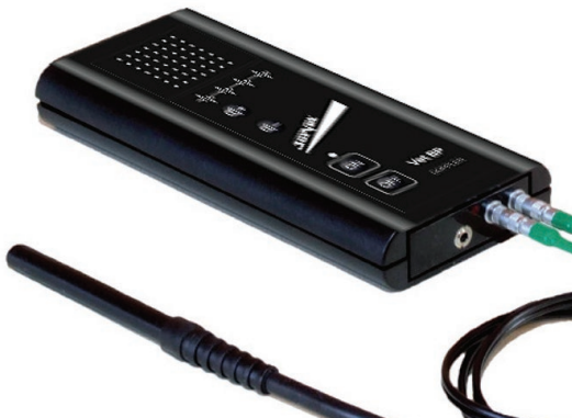
SKU | J0563ND10 Pencil Probe