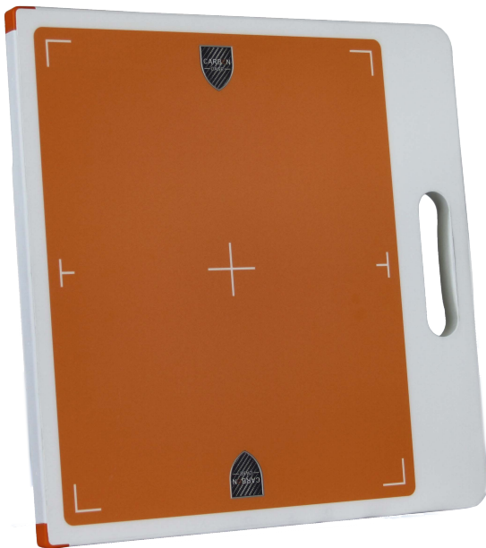
Ergonomic handle available on long or short axis