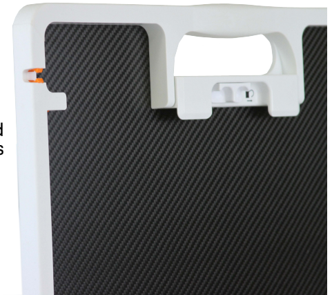
Fits most tethered DR panels