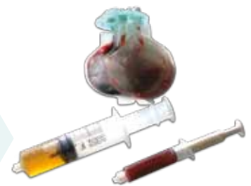
Syringes containing PPP and PRP

Contact your veterinary distributor to order Osteokine today!