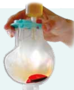
The platelet-poor plasma is decanted off, leaving the PRP pellet, which can now be re-suspended and extracted for use