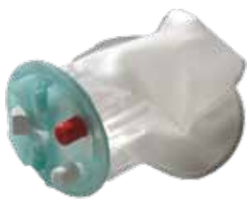
The empty Osteokine bag