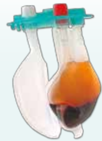
After the first spin