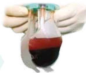
The first compartment is full and must now be centrifuged