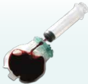
Whole blood is injected into the first compartment