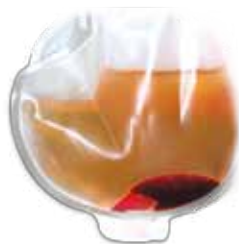
After the second centrifugation, the bag now contains platelet-poor plasma (PPP) as a supernatant and a pellet of platelet-rich plasma (PRP)