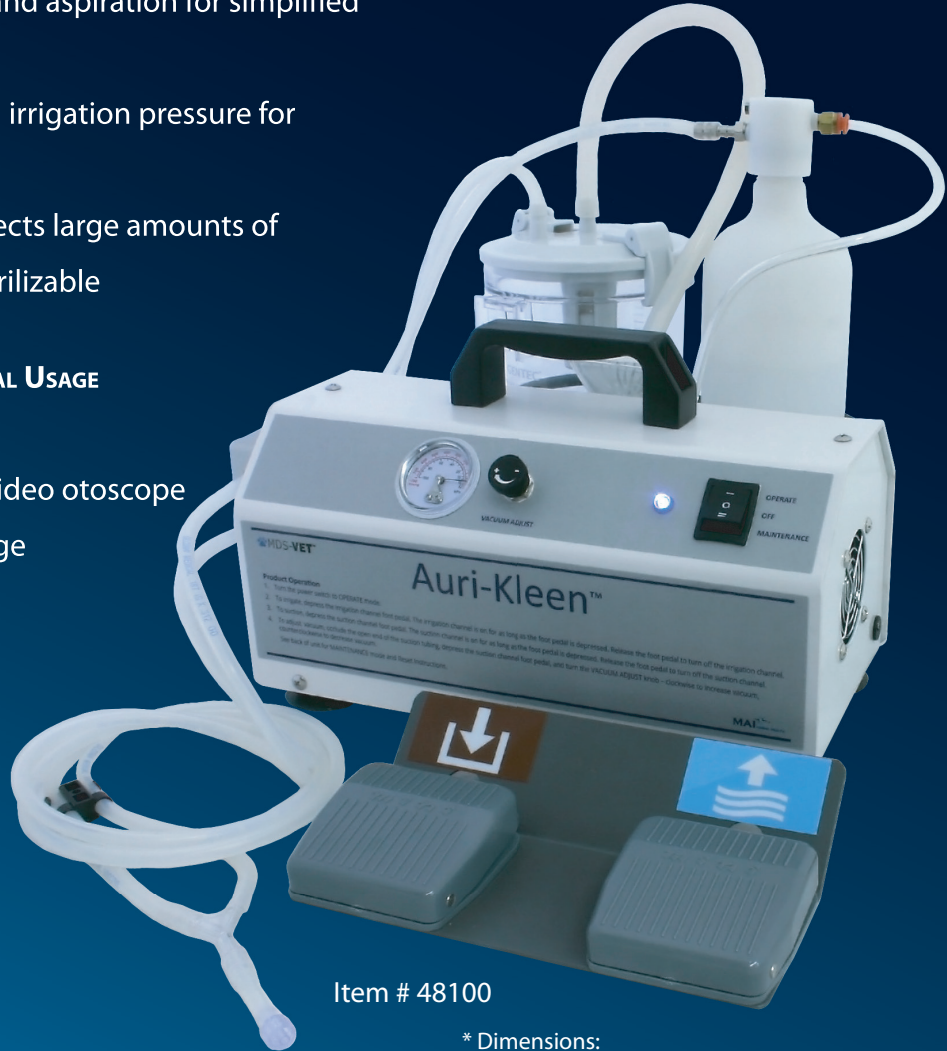
Item # 48100

* Dimensions: 13" Wide x 13" Deep x 16" High (with bottle)