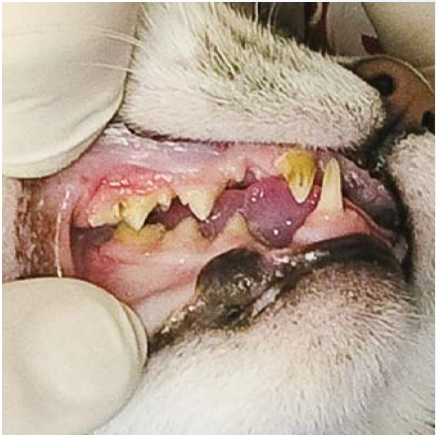
Cat Before SANOS®

NOTE: Reduction of plaque and observe gingival margin above upper right premolars 106, 107 & 108.