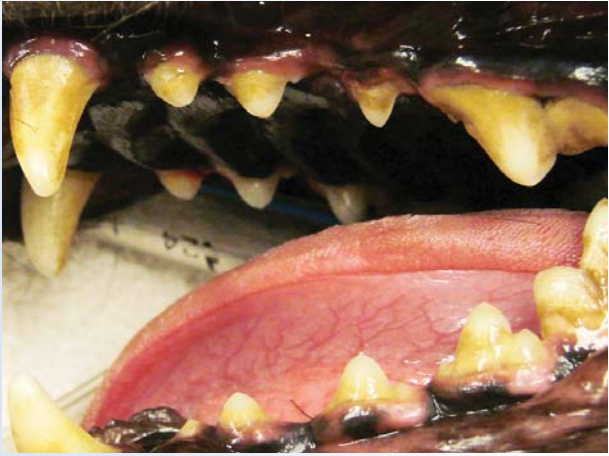
Dog Before Professional Dental Cleaning & SANOS®