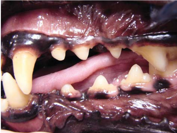
Dog 6 Months After Professional Dental Cleaning & SANOS®

NOTE: Be sure to apply a thick film to any observed trouble spots such as the carnassial upper 4 th premolar 208 and upper 3 rd premolar 207. Compare gingival margin at the upper 3 rd premolar 207 in photos: Before Professional Dental Cleaning & SANOS® and 6 Months After Professional Dental Cleaning & SANOS®.