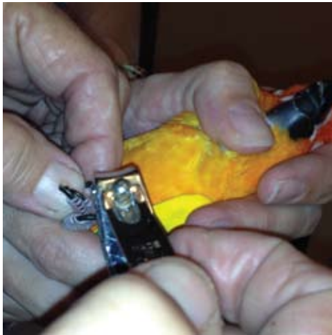
Bird nail trim