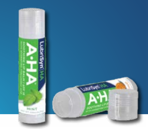
A-Ha! Lip Balm Mint

LubriSynHA sold in single bottle (one-month supply) or three-pack (three-month supply).