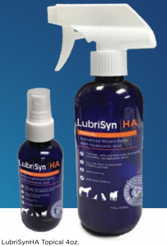
LubriSynHA Topical 11.8oz.