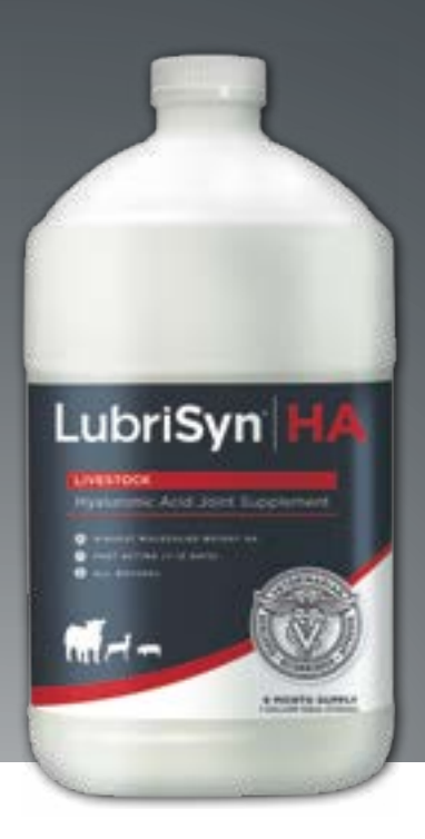
LubriSynLVS Gallon 128oz

Gallon size come with a 15ml pump. Optional carrying bag and dosing gun are also available for purchase.