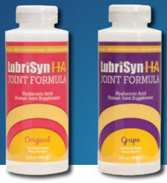
LubriSynHA 11.8oz. Original LubriSynHA 11.8oz. Grape

LubriSynHA is proud to offer our customers its newest formulation of your favorite lip balm, A-Ha! Our revolutionary lip balm provides the maximum amount of moisture with hyaluronic acid with the protection of SPF 15. Available in mint and original almond flavors, A-Ha! is the only lip balm you'll need to protect your lips from the driest of climates.