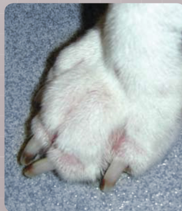
Day 28—Dog after treatment with GENESIS Topical Spray.

Important Safety Information for GENESIS® (triamcinolone acetonide) Topical Spray: For use on dogs only. The use of this product in dogs less than eight pounds, less than one year of age, breeding, pregnant, or lactating has not been evaluated. In a field study with GENESIS Topical Spray, polyuria, polyphagia, aversion/discomfort, sneezing or watery eyes were reported in dogs receiving treatment. For complete information or to obtain a package insert, contact Virbac at 1-800-338-3659, or visit us.virbac.com .