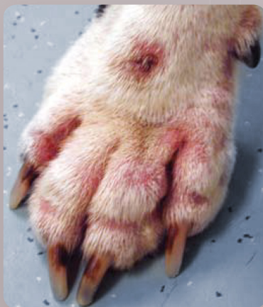
Day 0—Dog before treatment with GENESIS® Topical Spray.

Now you can control localized pruritus with a clinically proven topical spray that has achieved positive results within 28 days of use.