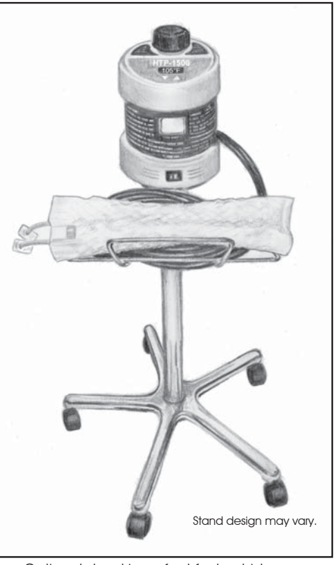
Optional stand is perfect for bedside use Order with or without a pad cradle