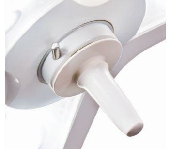
Sterilizable Center Handle Extremely smooth focus mechanism