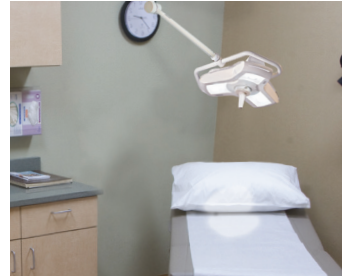
Compact Design 20" (51 cm) diameter lighthead