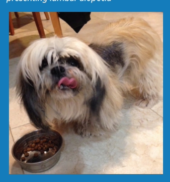
Figure 2. Eight weeks after feeding BLUE Natural Veterinary Diet® HF shows new hair growth beginning and skin condition improving

Figure 1. Day one of feeding BLUE Natural Veterinary Diet® HF shows presenting lumbar alopecia