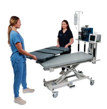
Seamless Transfers to Imaging

With or without the hard top stretcher, the Surgical Support Gurney facilitates smooth transfers to and from the surgical table.