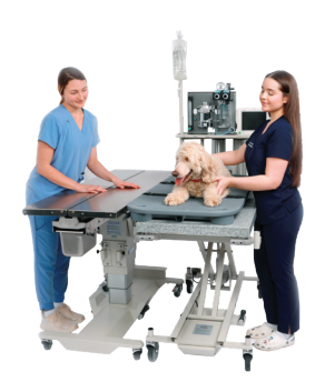
Transfer Patients Without Lifting

Gurney<sup>™</sup> is designed to move easily anywhere in your hospital and to accomodate patients up to 200 lbs.