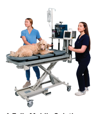
A Fully Mobile Solution The Olympic Surgical Support

Gurney<sup>™</sup> is designed to move easily anywhere in your hospital and to accomodate patients up to 200 lbs.