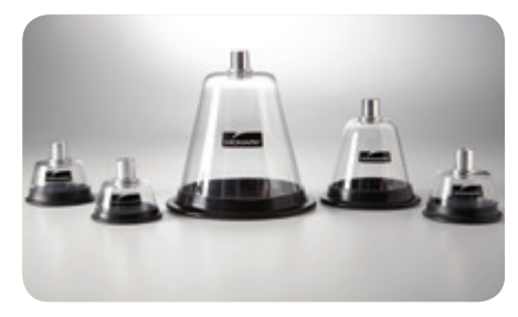
Small Animal Anesthesia Masks