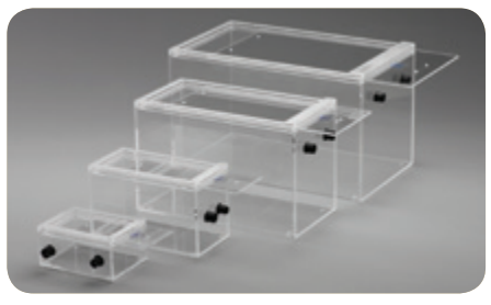
Small Animal Induction Chambers

Adapters Bellows Demand Wye Mounting Arms/Plates Replacement Parts Stands Supply Hose