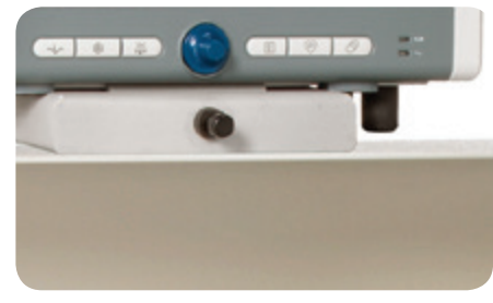
Cardell<sup>®</sup> Monitor Mount for VMS<sup>®</sup> Plus