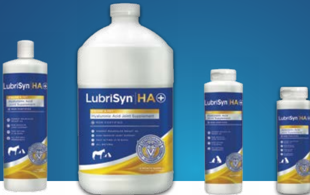
LubriSynHA Plus Quart