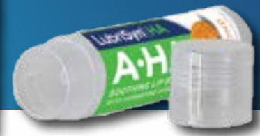
A-Ha! Lip Balm Almond

LubriSynHA sold in single bottle (one-month supply) or three-pack (three-month supply).