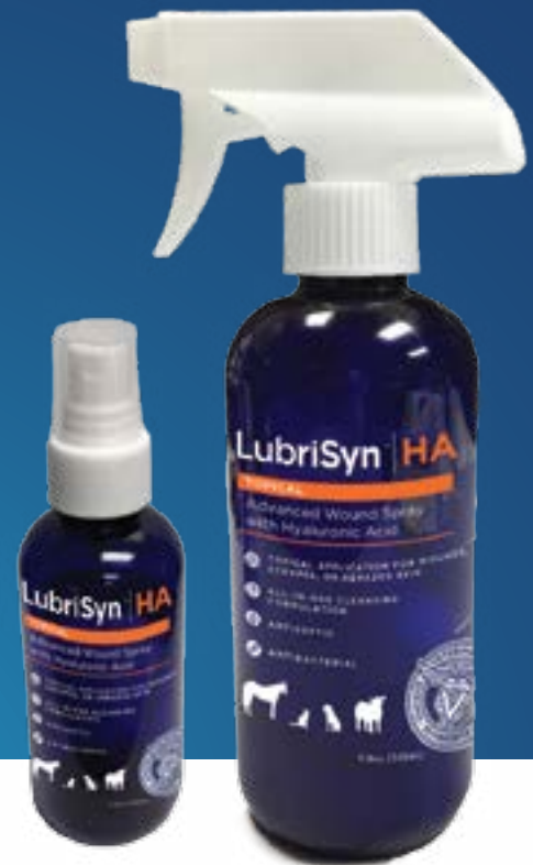
LubriSynHA Topical 4oz.