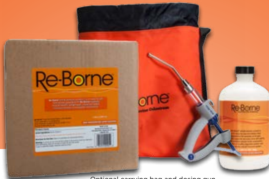
Optional carrying bag and dosing gun

The worldwide demand for quality protein is at an all-time high. That's why all producers are looking to minimize morbidity and mortality and maximize health and productivity. Re-Borne allows you to maintain thriving, high-quality livestock without the use of steroids.