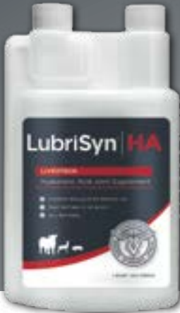
LubriSynLVS Quart 32oz

*Quantity can be doubled for initial 7 days or prior to competition.