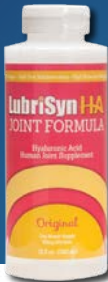
LubriSynHA 11.8oz. Original

LubriSynHA is proud to offer our customers its newest formulation of your favorite lip balm, A-Ha! Our revolutionary lip balm provides the maximum amount of moisture with hyaluronic acid with the protection of SPF 15. Available in mint and original almond flavors, A-Ha! is the only lip balm you'll need to protect your lips from the driest of climates.