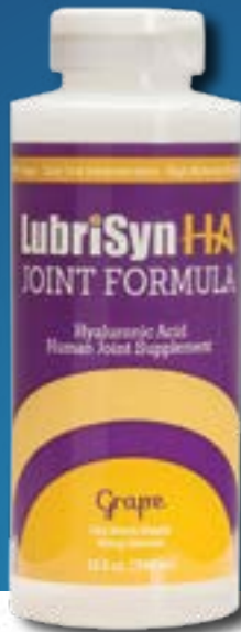
LubriSynHA 11.8oz. Grape