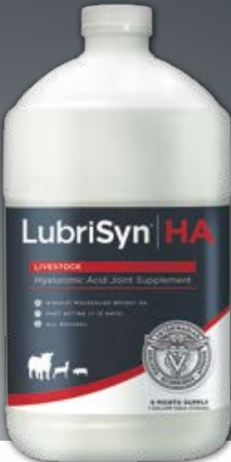
LubriSynLVS Gallon 128oz

Gallon size come with a 15ml pump. Optional carrying bag and dosing gun are also available for purchase.