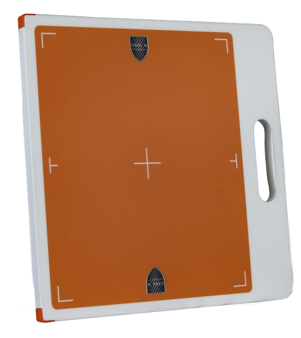
Ergonomic handle available on long or short axis