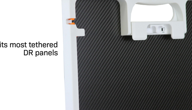
Fits most tethered