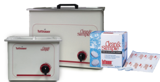
Clean&Simple™ Ultrasonic Cleaners and Tablets

Documents: date, time, temperature, pressure.