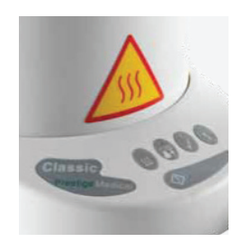
Easy to use control panel