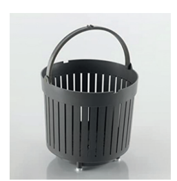
Basket for easy loading and unloading