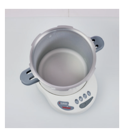
Top view, easy access