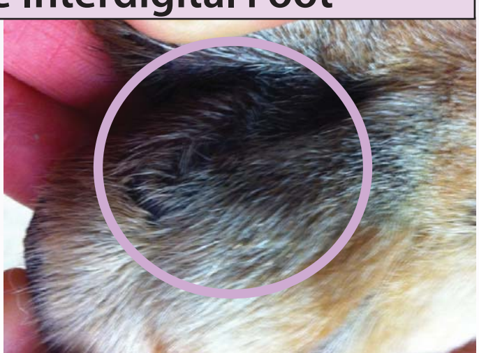
21 Days After CutoGuard®