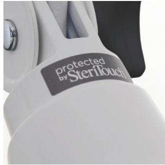
Protected by SteriTouch® antimicrobial powder coating