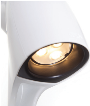
Recessed light source inside light head to reduce glare.