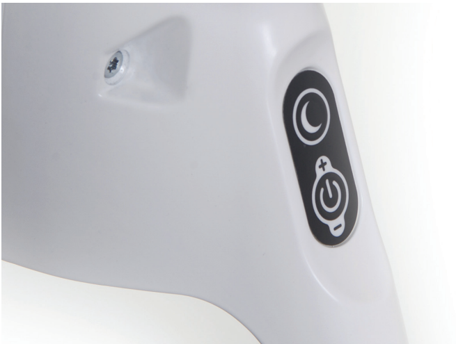
Dimming and integrated "night-watch" for user comfort and convenience.