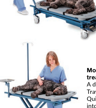
Easy-roll gurney Lightweight electric lift rolls easily over all outside surfaces. 300 lb weight capacity*. *Quick-Lock Version