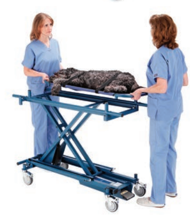
Lift the stretcher, not the patient Safer. Helps prevent injuries. Perfect for transfers from the back of vehicles.

Versatile – The Olympic Versa-Lift will save you time and labor every day. This mobile electric lift combines three useful pieces of equipment for the price of one. Quickly pays for itself.