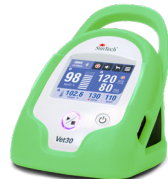
Tree Frog Green