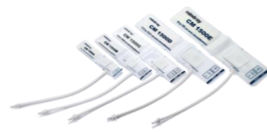
NIBP: Variety of cuffs fit multiple patient sizes