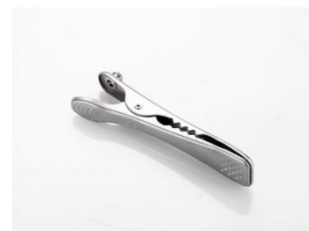
ECG: Non-traumatic alligator clips